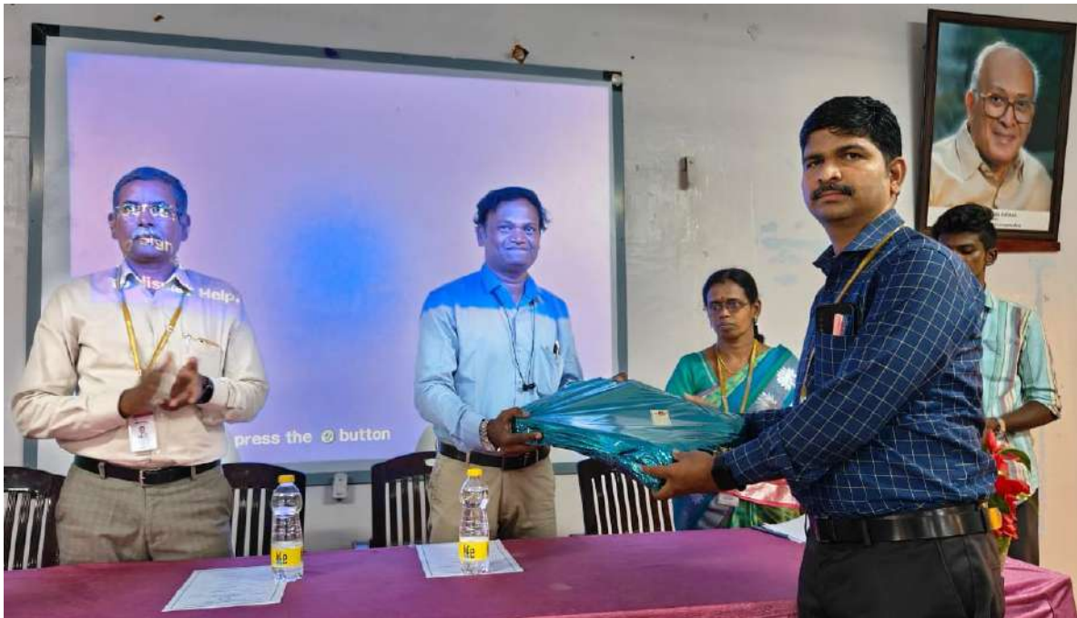
Presenting Memento to Chief Guest