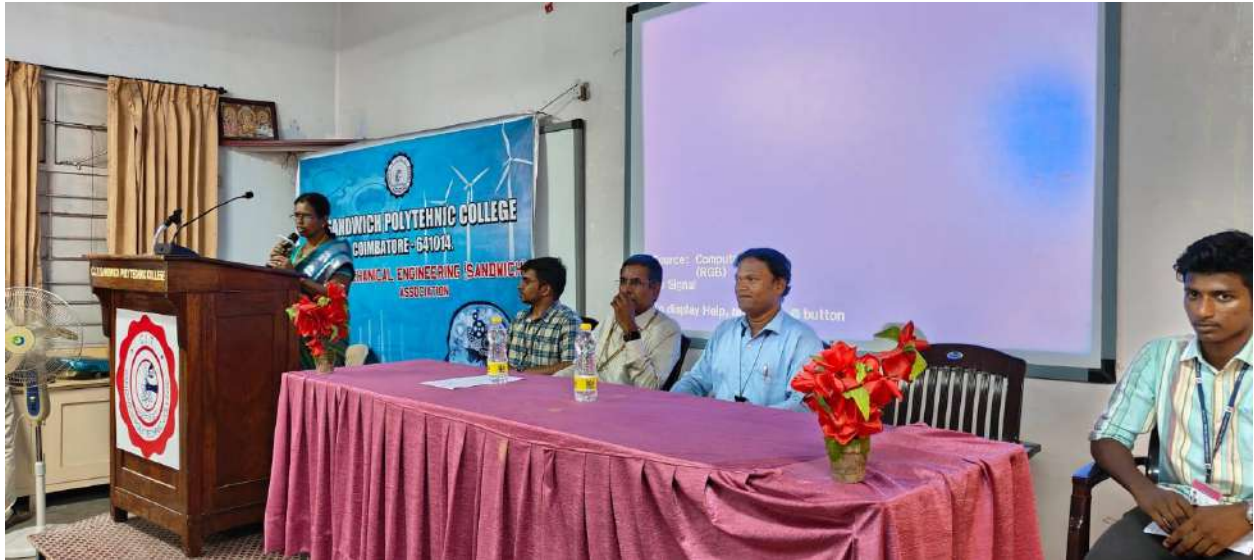
During Introduction of Chief Guest