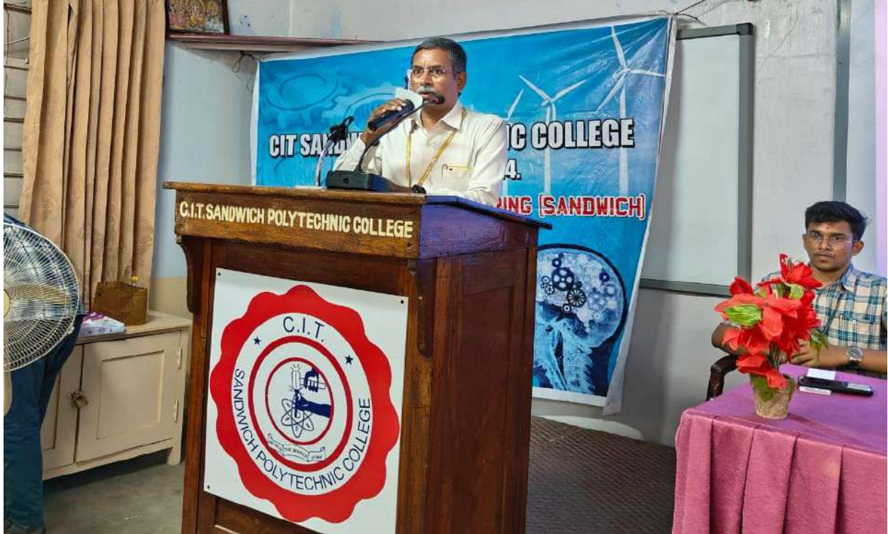
Felicitation Address by our Head of the Department