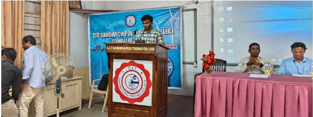
Welcome Address by Student Chairman