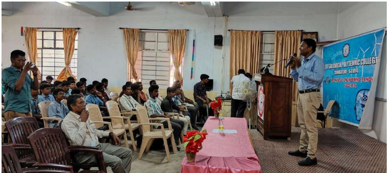
Students listening the speech interestingly