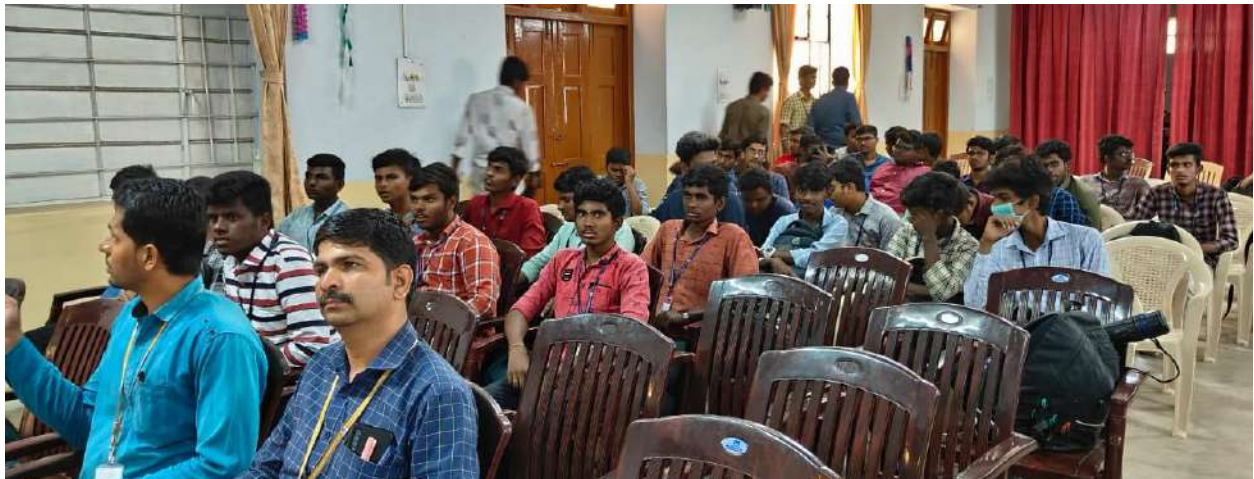
Faculty and Students at the gathering