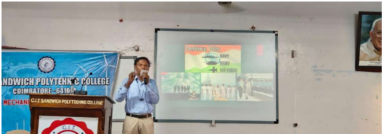
Motivational Speech by Chief Guest