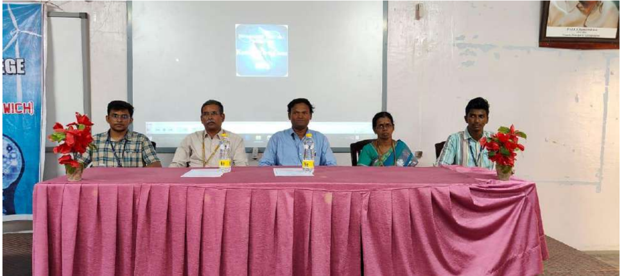
Members present on the dais