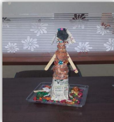
Sanjith 3 rd year

“KRAFT MAKING FROM WASTE THINGS” on 08/10/2022, in LH 12 and LH13. Students were used their creative thoughts and create the Kraft’s from waste things. This activity encourage the students to save the environment by recycling the waste.