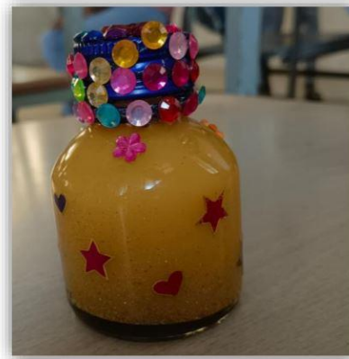
Agilesh 3 rd year