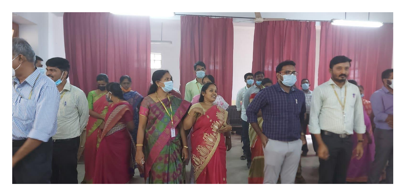
A delecious lunch was provided to all participants and staffs. Afternoon session is ended with getting feedback from participants.